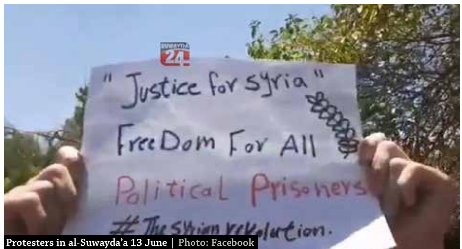
Protesters in al-Suwayda'a 13 June