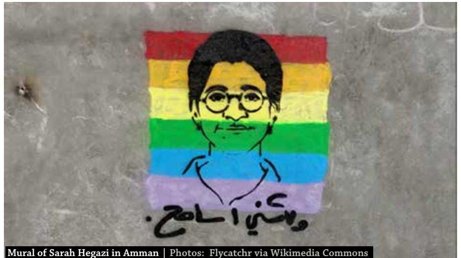
Mural of Sarah Hegazi in Amman | Photos: Flycatchr via Wikimedia Commons

State violence and police brutality targeted at sexual minorities is rife