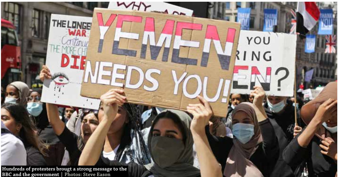
Hundreds of protesters brought a strong message to the BBC and the government