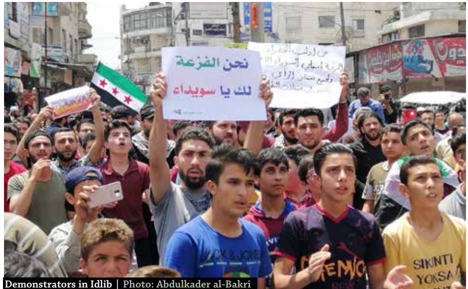
Demonstrators in Idlib

While these measures did not dissuade the demonstrations, protesters, however, became more