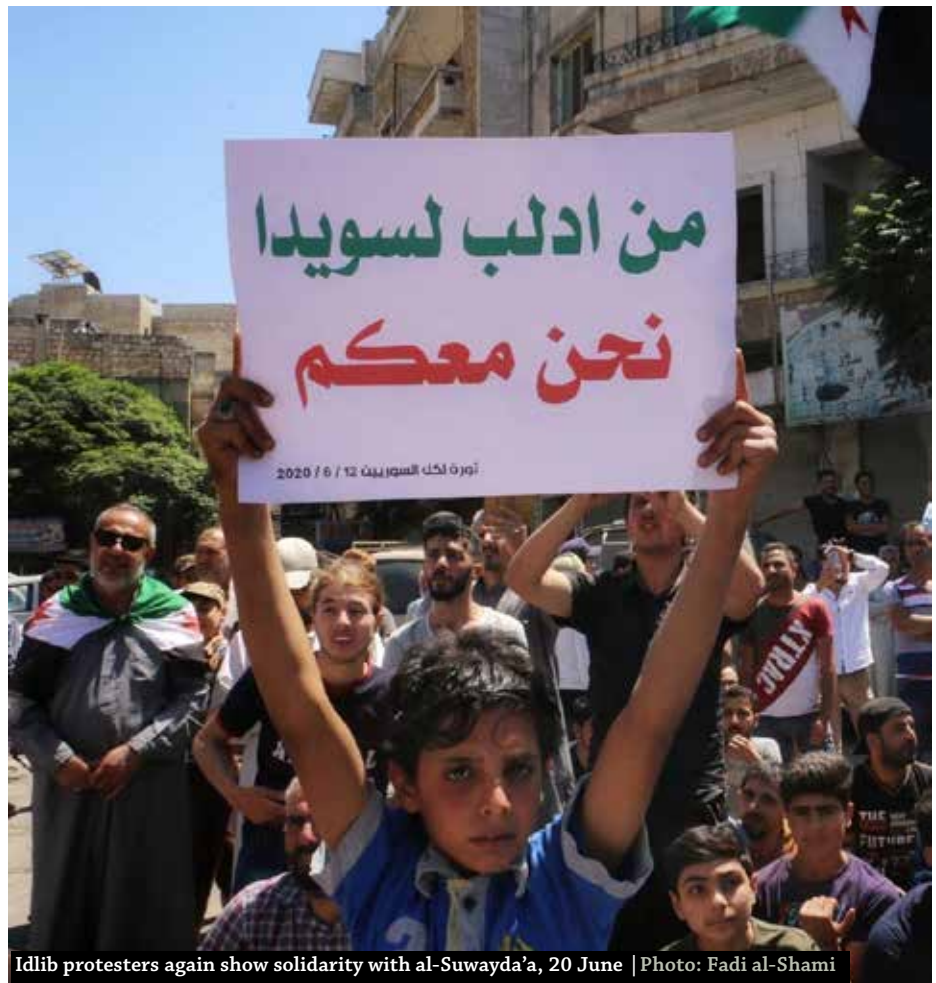
Idlib protesters again show solidarity with al-Suwayda'a, 20 June