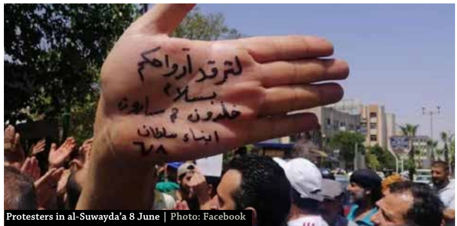
Protesters in al-Suwayda'a 8 June