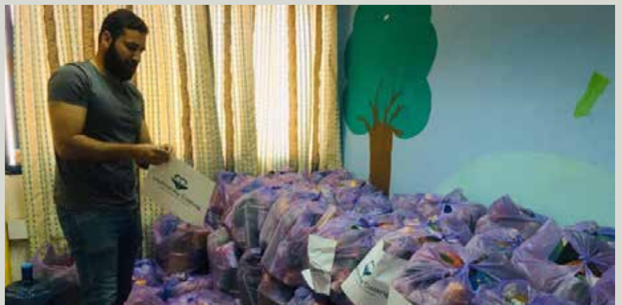
Facing page and top: Checkpoint, Susiya village. Centre left: Tackling Covid 19 near Hebron. Centre right: Home visiting, Aida youth project, Bethlehem. Bottom: Preparing food parcels, Aida youth project

home visits, each two volunteers going to visit 10 or 12 houses, providing reassurance to people, telling them about symptoms of the virus and what they can do to protect themselves from it."