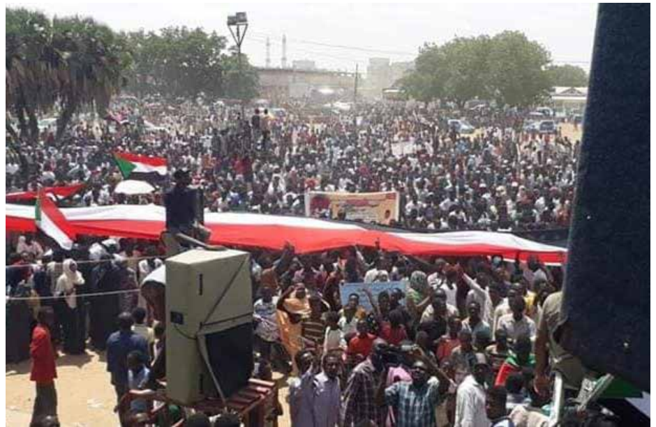
Top Left: Women join protests in Abu Jubaiha, a town of 20,000 people in South Kordofan. Top Right: Mobilising in Niyala. Bottom Left: Wadi Halfa's Resistance Committee takes to the streets. Bottom Right: Crowds mass for rally in El Obeid on 30 June. Independent station Radio Dabanga reported on mass marches in Khartoum, Port Sudan, Dongola, El Geneina, El Obeid, and all of the camps for the internally displaced in Darfur.