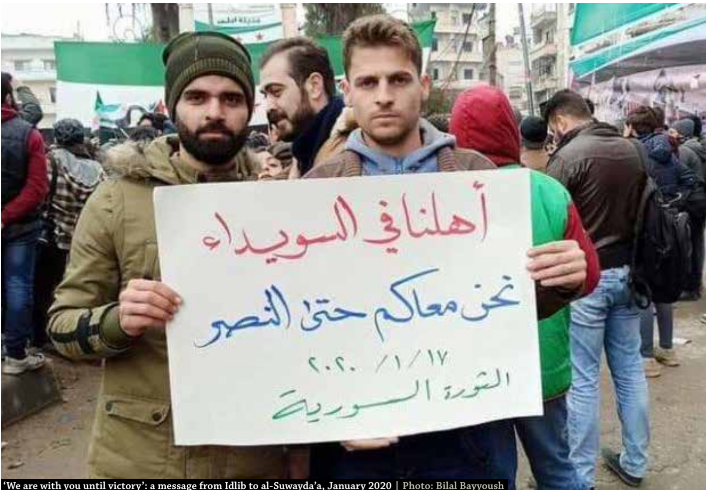
'We are with you until victory': a message from Idlib to al-Suwayda'a, January 2020