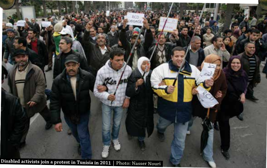
Disabled activists join a protest in Tunisia in 2011