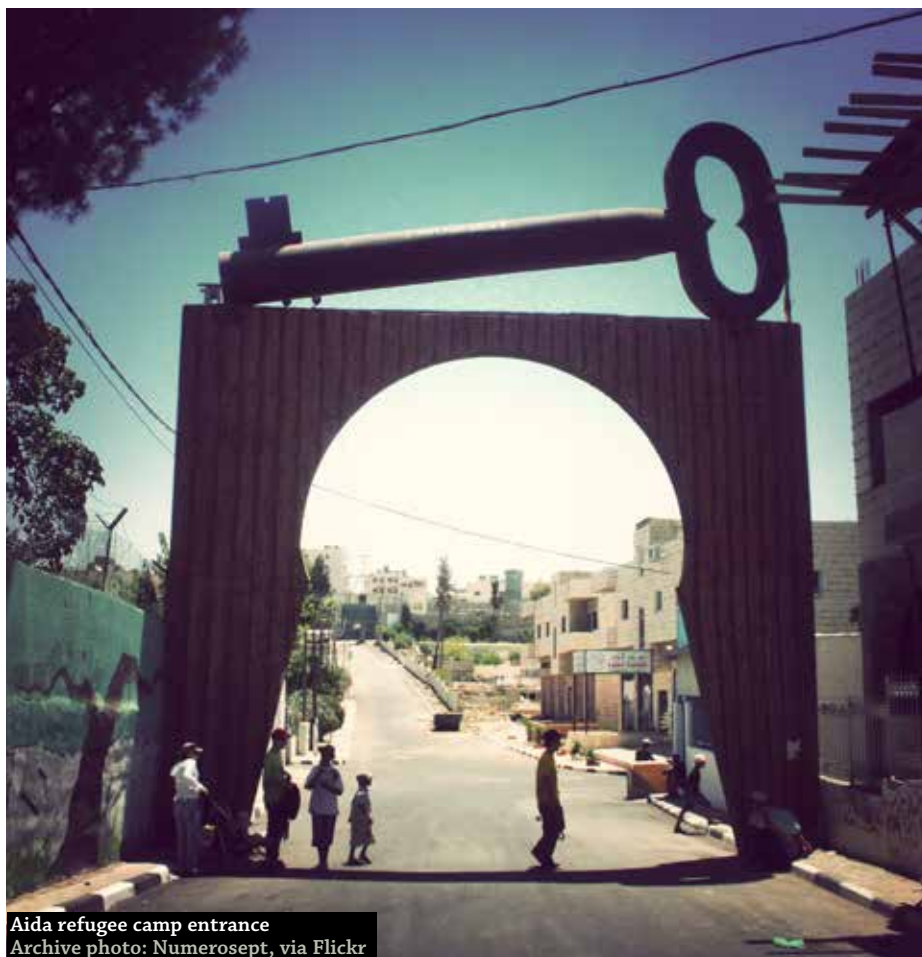
Aida refugee camp entrance

Since early March HIRN has helped to purchase 500 Coronavirus fighting kits, and sent food baskets to ten families isolated from shopping in Bethlehem because of Palestine Authority travel restrictions imposed because of the coronavirus. Further food assistance has been given to families in the old city of Hebron. Funds were also raised to provide