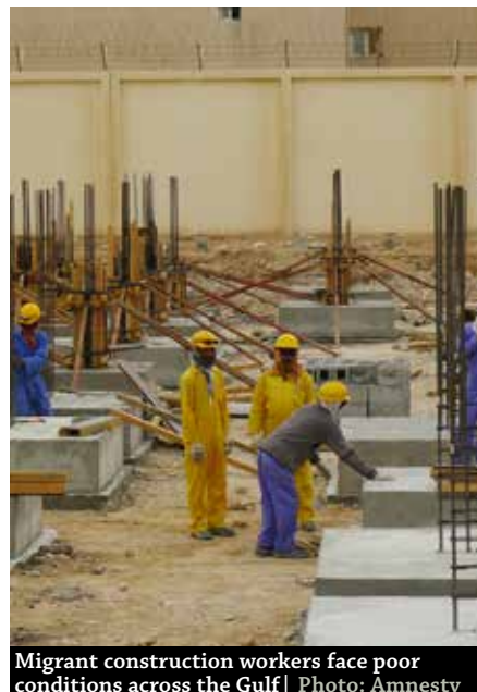
Migrant construction workers face poor conditions across the Gulf

The UAE is one of a number of states in the region which uses the "Kafala system", an employment framework that requires migrant workers to have a sponsor residing as a national of the country. Without their employer's permission, a worker cannot leave the job, change jobs, or exit the country.