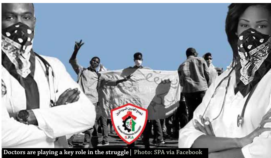
Doctors are playing a key role in the struggle

Sudan is a great country, it covers 1 million sq miles, the size of Western