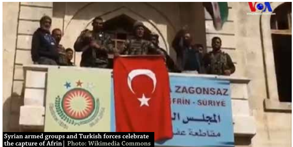
Syrian armed groups and Turkish forces celebrate the capture of Afrin

Those who remain have been unable to build up substantial profits because of extortion by the armed opposition groups and are unlikely to be able to afford the Chamber’s hefty registration fees. This process creates a gap which a new economic elite whose interests are bound up with those of the armed opposition groups and the Turkish state is starting to fill.