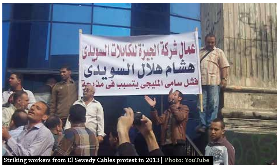
Striking workers from El Sewedy Cables protest in 2013

Recent legislation attacking workers’ rights includes a 2017 law which criminalises strikes in “strategic sectors” and makes the establishment of so-called “political” trade unions, such as those outside the state-controlled union federation, punishable