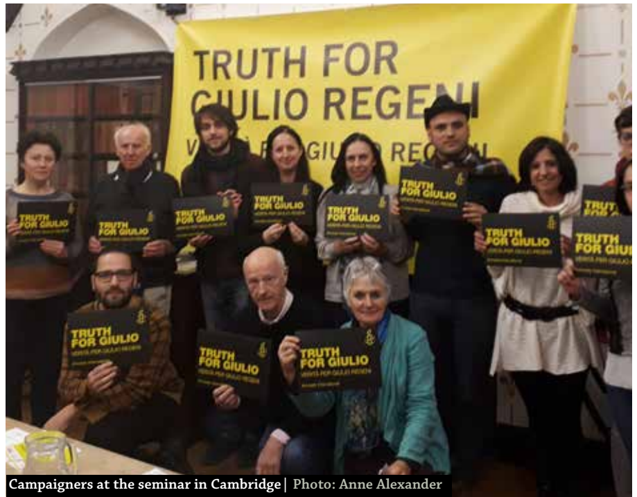
Campaigners at the seminar in Cambridge