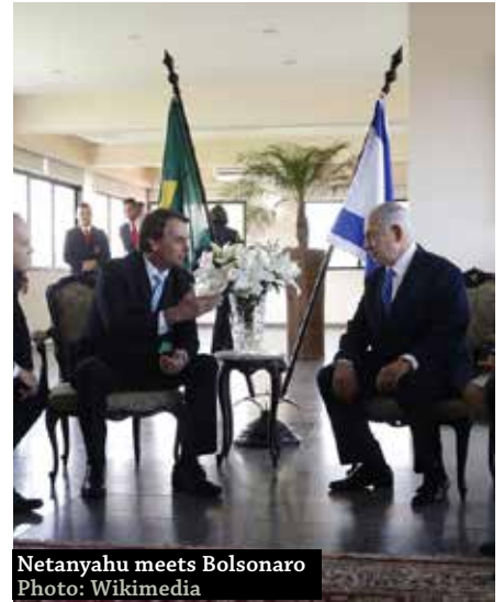
Netanyahu meets Bolsonaro

Netanyahu has tried to overcome this isolation by aligning himself with other ultranationalist leaders around the world, such as Victor Orban in Hungary and Brazil's Jair Bolsonaro. In February, he unveiled an enormous billboard in central Tel Aviv which depicted him