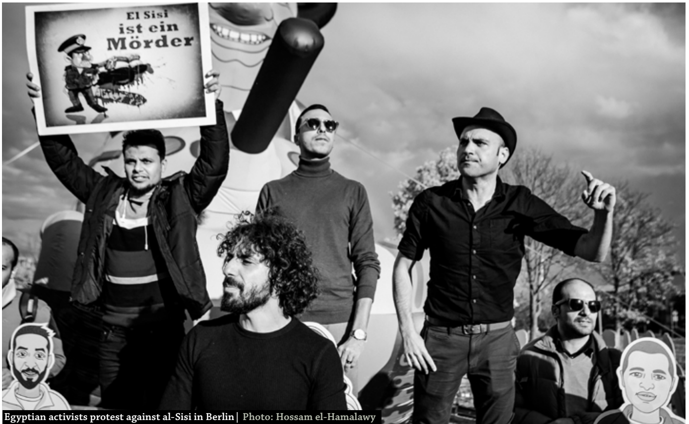
Egyptian activists protest against al-Sisi in Berlin