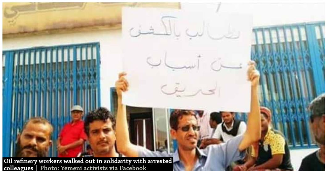
Oil refinery workers walked out in solidarity with arrested colleagues

with the Gulf monarchy's latest intervention, the UAE has the upper hand together with corrupt remnants of Saleh's regime.