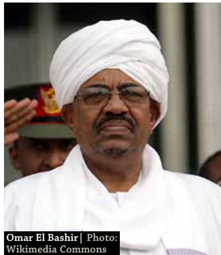
Omar El Bashir

South Kordofan is another oil-rich region in the south of Sudan. Although the local population desires to be a part of newly independent South Sudan, the El Bashir regime is using violence in a bid to keep control of the territory.