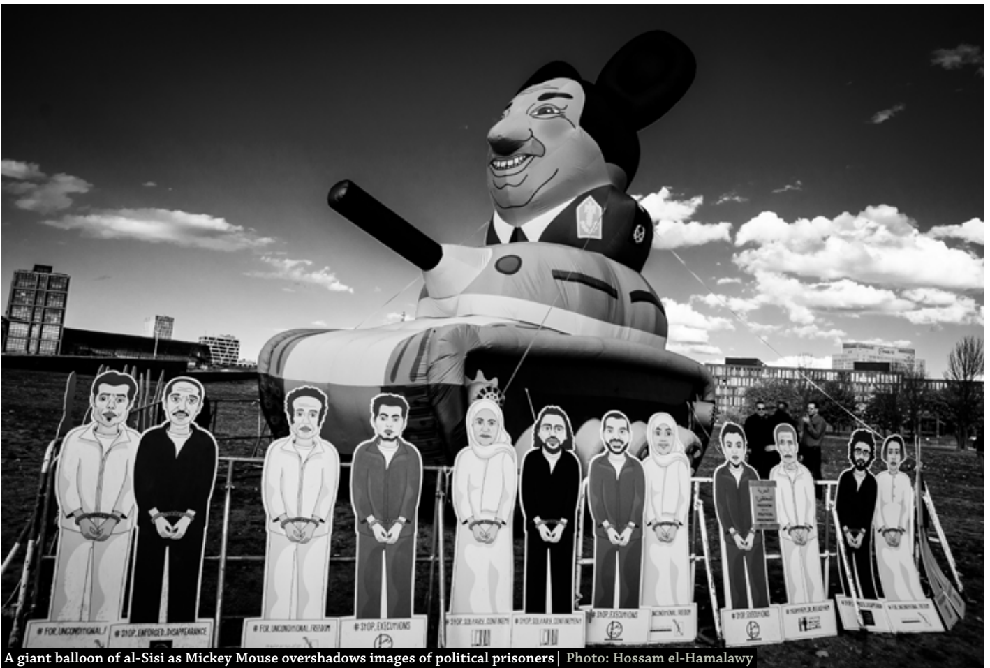
A giant balloon of al-Sisi as Mickey Mouse overshadows images of political prisoners

vast sums of money to build up these partnerships.