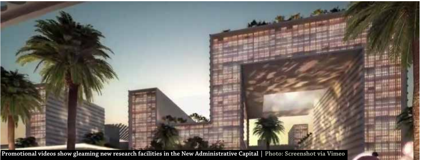
Promotional videos show gleaming new research facilities in the New Administrative Capital