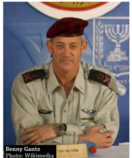
Benny Gantz