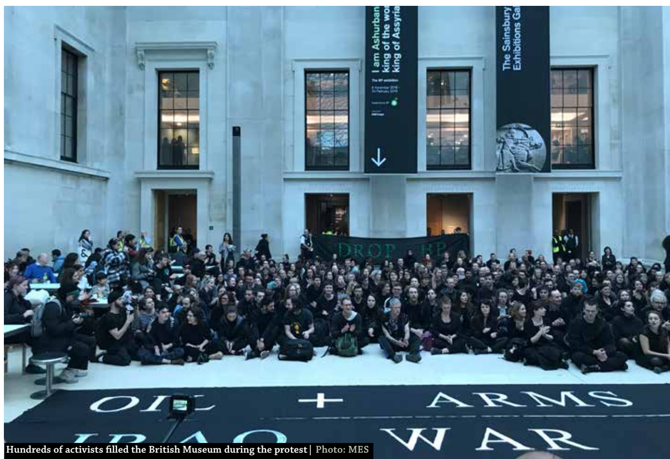
Hundreds of activists filled the British Museum during the protest