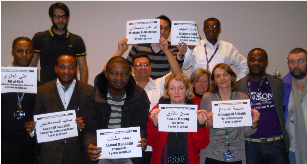
Healthworkers from UNISON at University College London Hospitals sending a message of solidarity to their Bahraini colleagues – March 2013